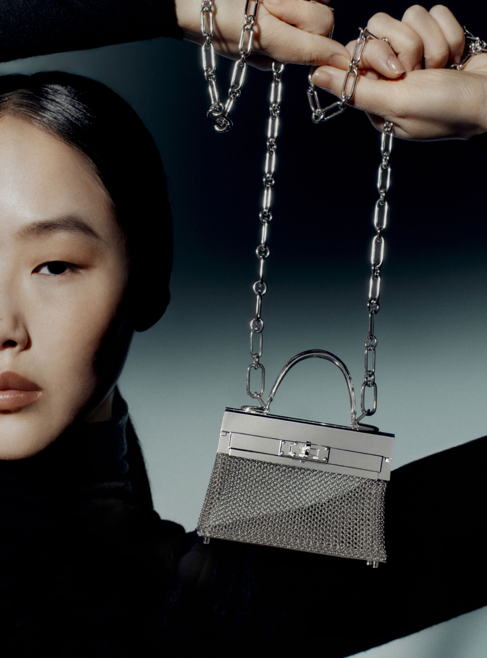
SAC BIJOU KELLY, silver