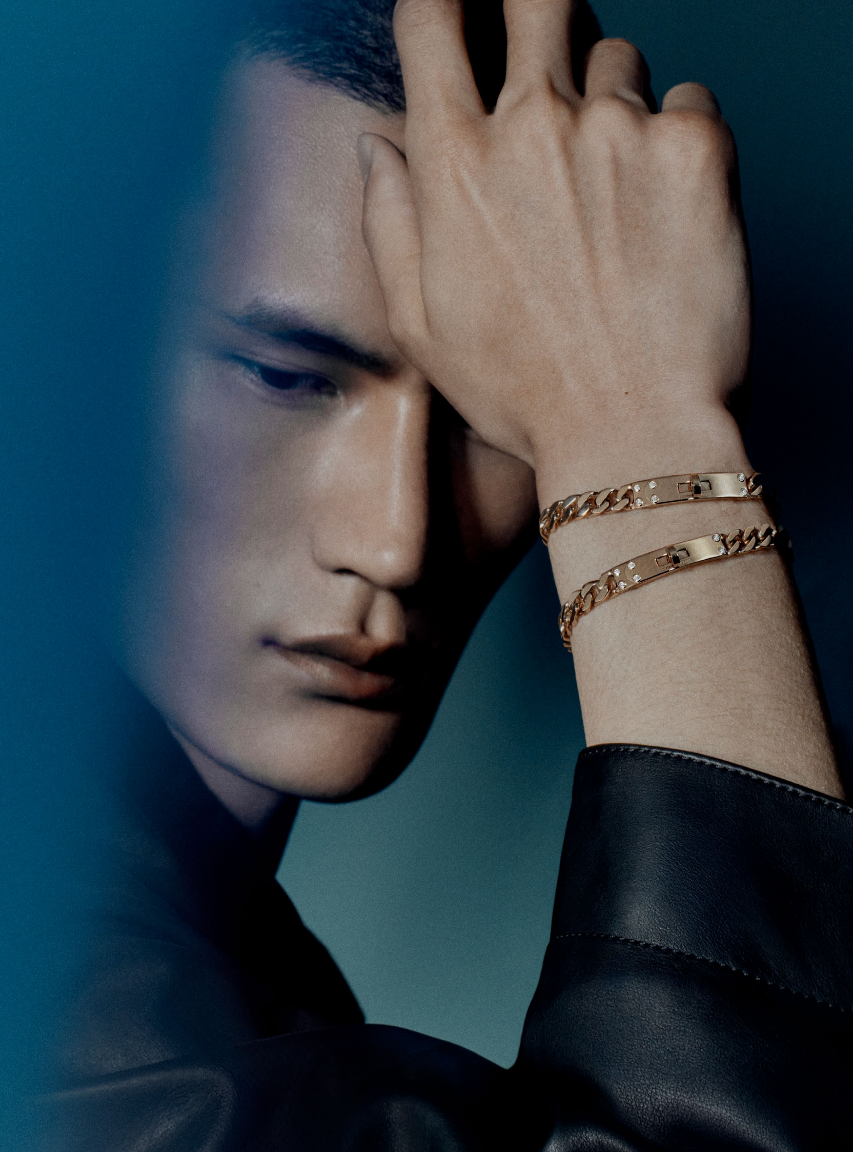
KELLY GOURMETTE BRACELETS, rose gold and claps semi-pavé-set with 6 diamonds (0.08 carats)