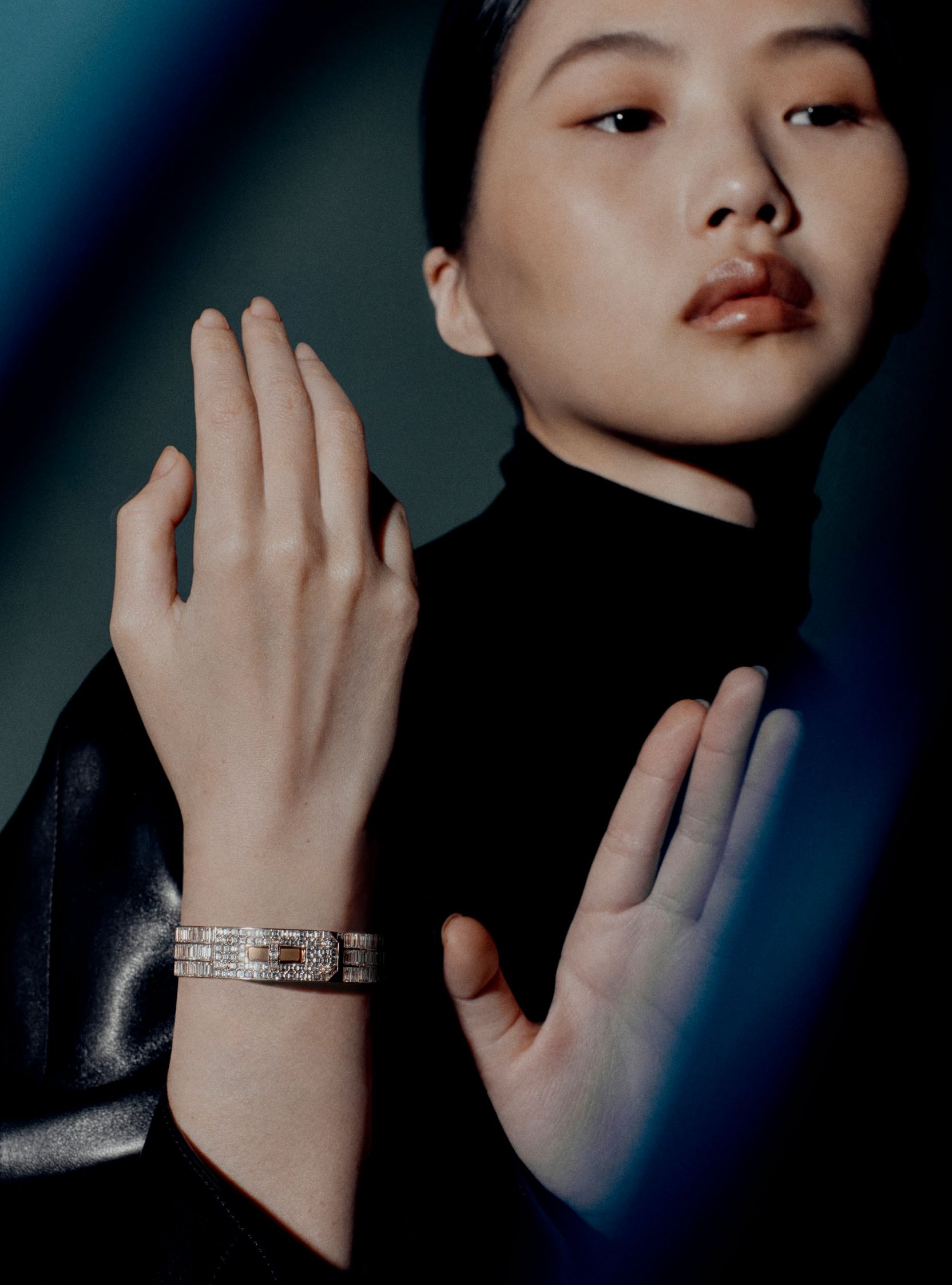
KELLY BAGUETTES TRIPLE-ROW BRACELET, rose gold and 275 diamonds (31.99 carats)